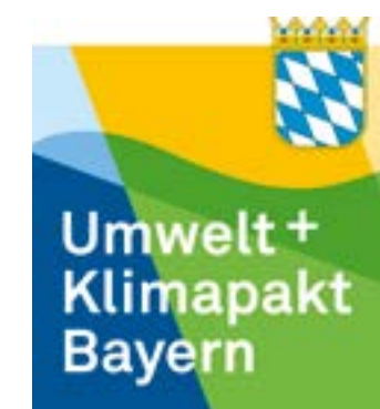
Bavarian Environmental Pact