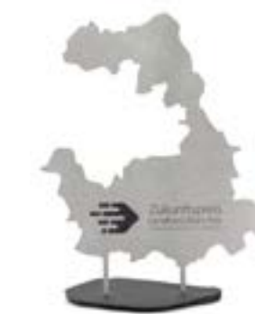
Future Award Munich District 2022